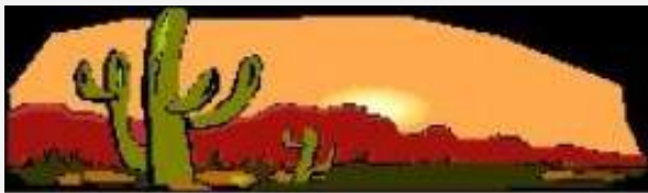
Sonoran Desert Security User Group